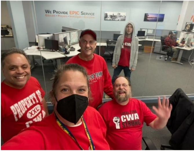
CWA 7250's Rove Bargaining Team